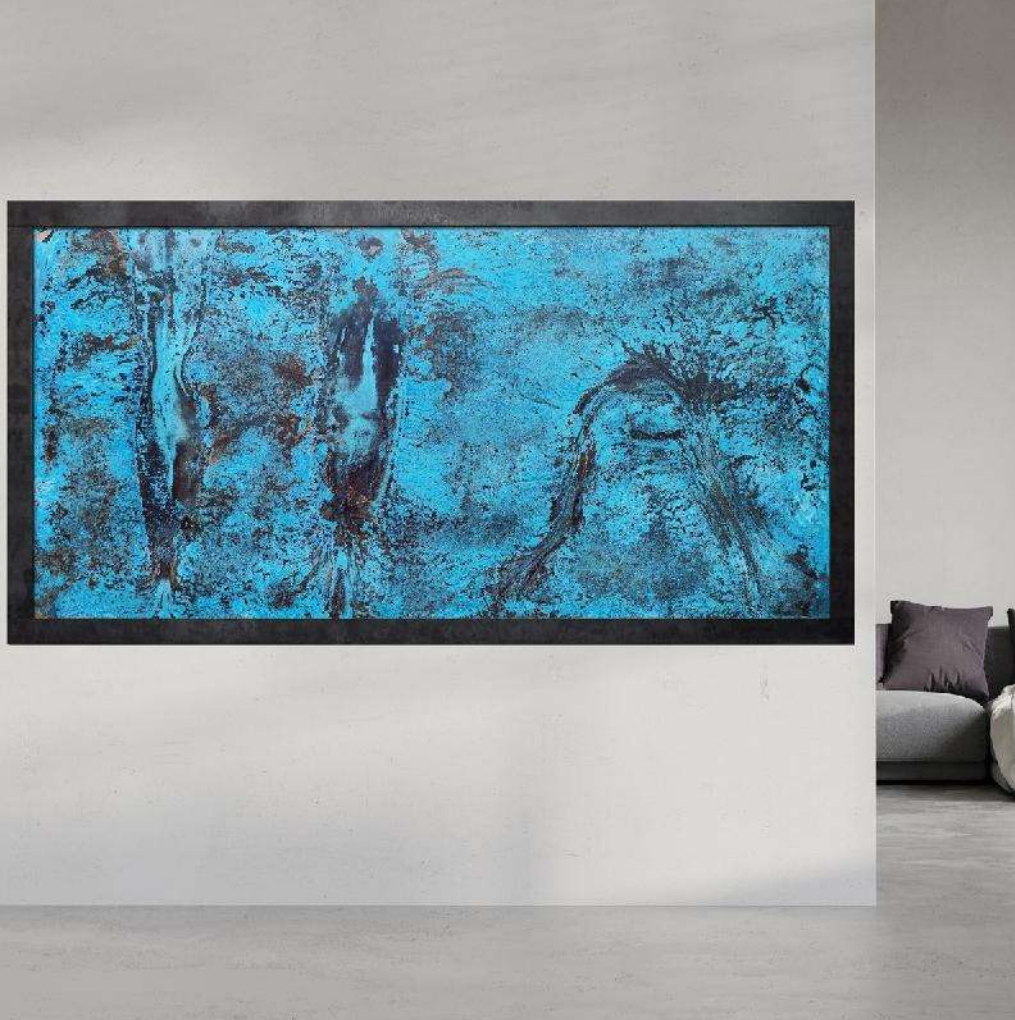
MAVI, WHEN THE OXIDATION OF COPPER APPROACHES ABSTRACT ART. ; Metal-morphosis Collection by @Planium. Design di Işıl Çığatay.

Editorial Team on August 26, 2022 / Comments closed