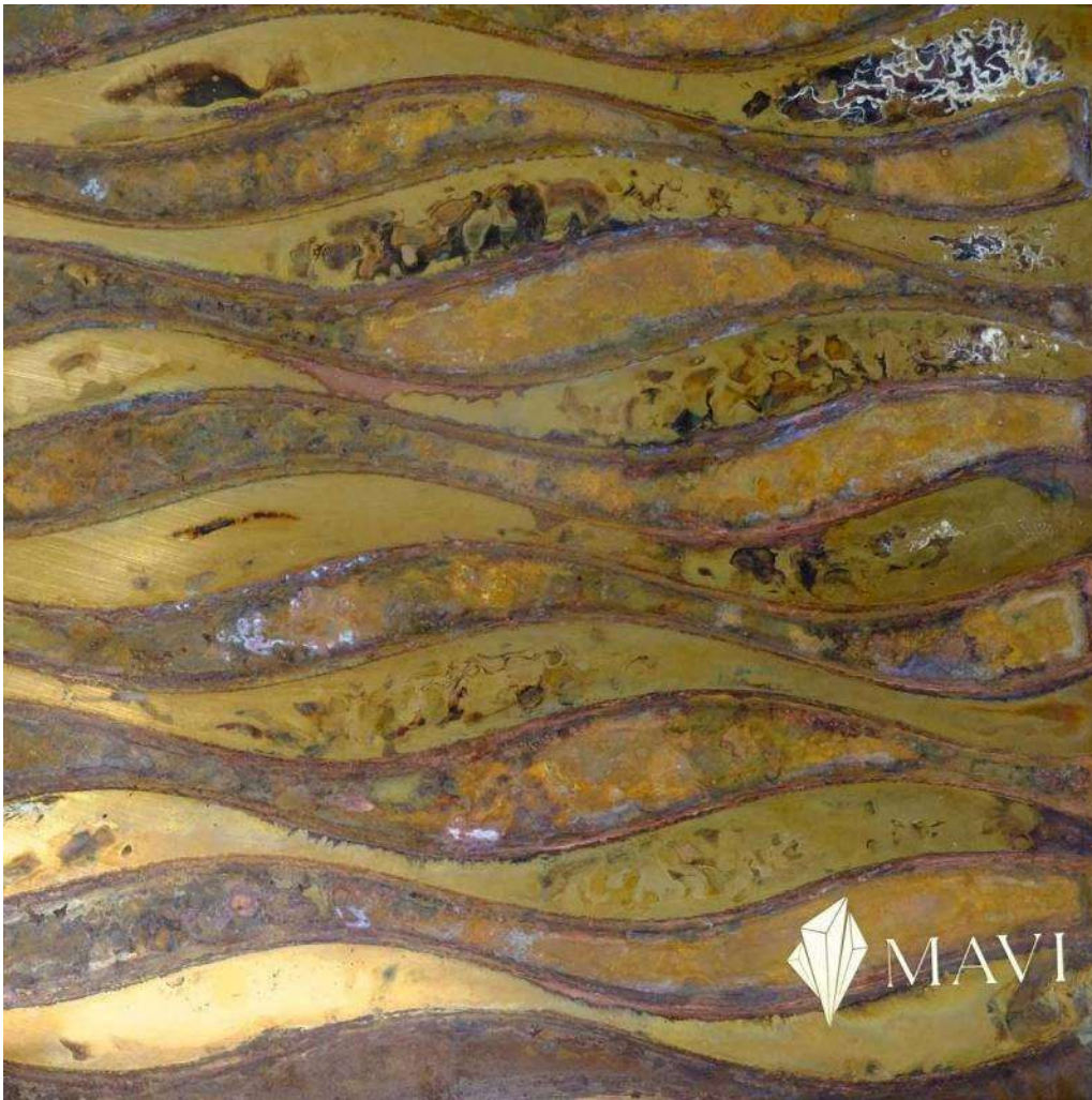
@Planium; A real Atlas of the colors of earth and water: brown, Olive, Cinnabar, Straw Yellow, Honey, Earth of Cassel, Fawn ... Cyan, Turquoise, Aquamarine, Cornflower ..